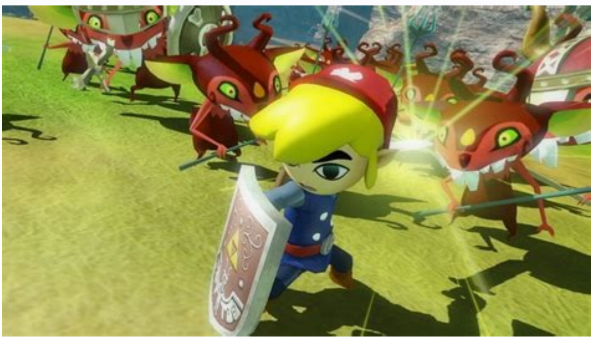
Guide breath of the wild.